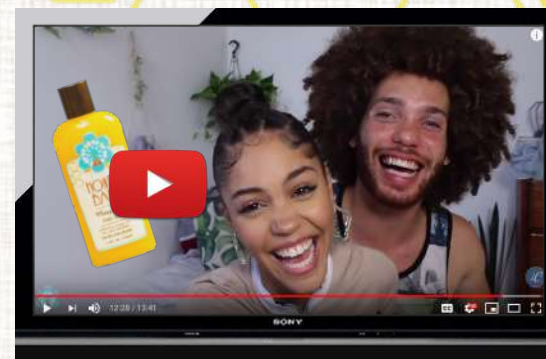
MY HUSBAND DOES MY CURLY HAIR

Premium honey-derived hair and skincare line for the entire family.