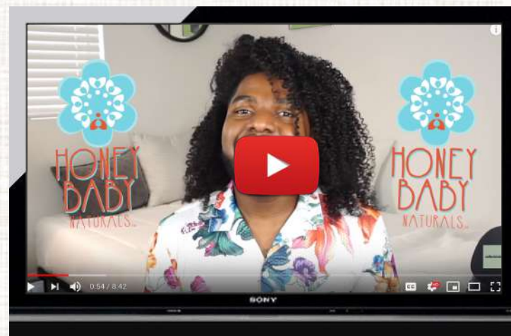
NEW GEL ALERT! Honey Baby Naturals